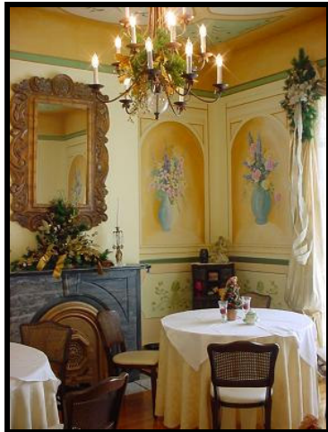
Gracious dining rooms And Luxurious bedrooms